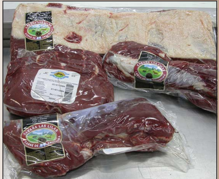
Argentine beef packed and labeled.

ATFA and USCA met with several members of Congress, including representatives from the House Committee on Agriculture, to raise concerns over Argentina's actions, including a proposal from the USDA which would allow the impor-