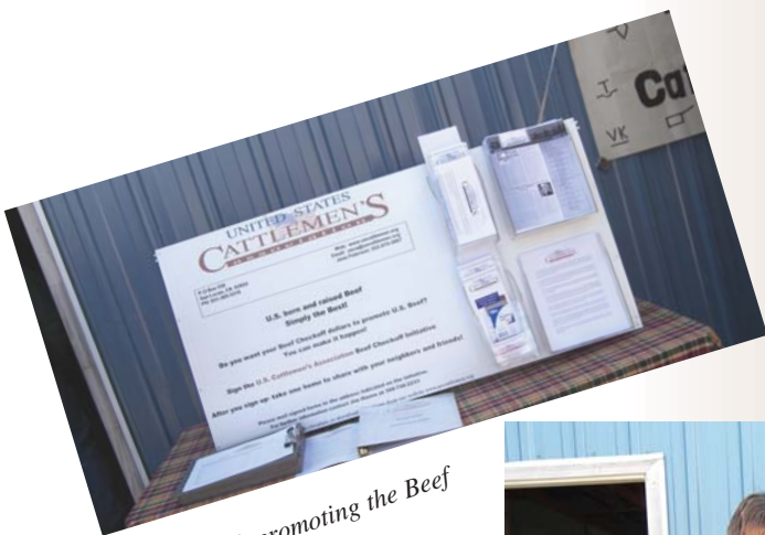
USCA booth promoting the Beef Checkoff petition