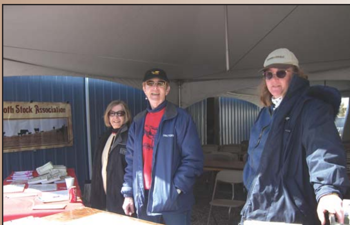
The Beartooth Stock Association working the registration desk at the Midland Bull Test Sale.